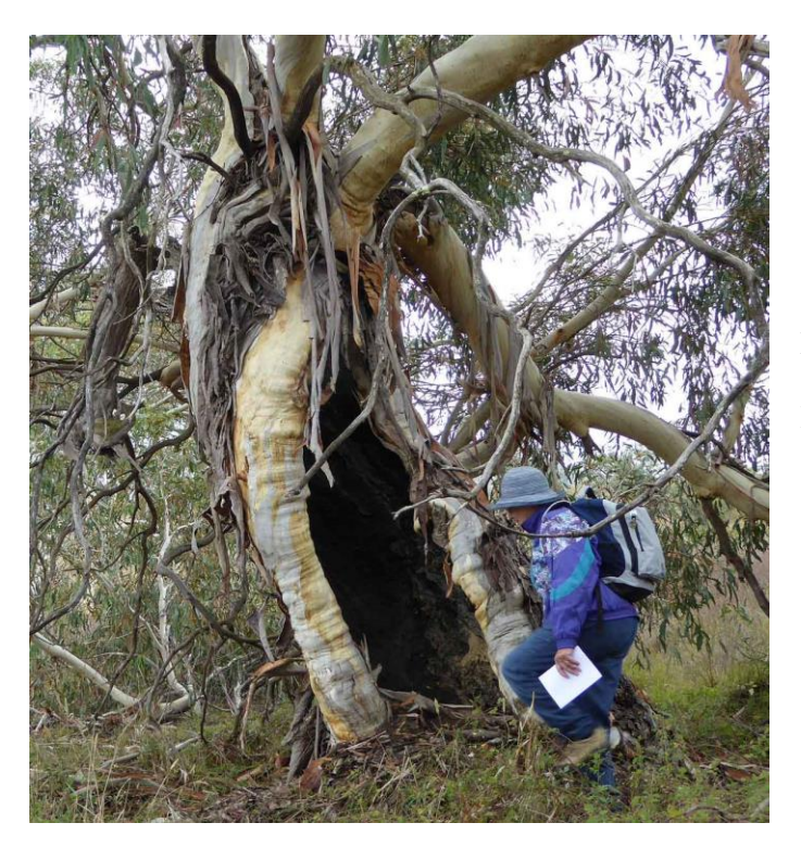
Fig. 6. Pryor's Snow Gum, Glenloch Interchange.

From 2001, as more detailed proposals for the siting of the road became known, local conservationists mobilised to minimise the impact on this area. The energetic community advocacy of Jean Geue, Peter Ormay and the Friends of Aranda Bushland was instrumental in lobbying and negotiating with key officials in government to influence the siting of the road and to preserve a rare and unique stand of snow gums at Glenloch Interchange, including the 'roadside relic' known as 'Pryor's Snow Gum'. Significantly, the proposed design at Glenloch Interchange was modified to reduce the intrusion of roads into the grasslands on the slopes of Black Mountain, resulting in a smaller area of three hectares being excised from the reserve to reposition a bike path. <sup>140</sup>