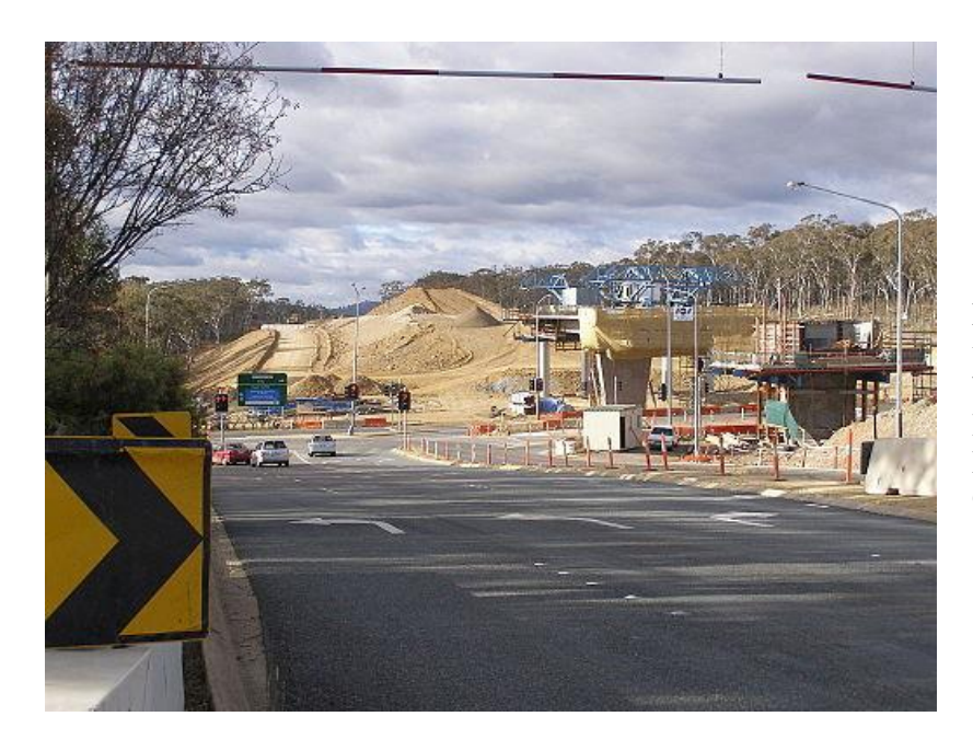
Fig. 5. Construction of the GDE at Belconnen Way and Caswell Drive.

Of the three options for the alignment of the JDP, the major potential impact for Black Mountain was the likelihood of the freeway running to the south of Belconnen Way on the east side of Aranda on, or in addition to, Caswell Drive. Aranda residents voiced concerns about noise, access and safety. The challenge was how to balance the concerns of residents in eastern Aranda while minimising intrusion into the western side of Black Mountain. Although the authors of the study recognised the likely impact of the road on the 'ecological and recreational integrity' of Black Mountain and Aranda Bushland, they concluded that it would be 'affected only marginally because any disturbance would be adjacent to an existing road corridor.' 132