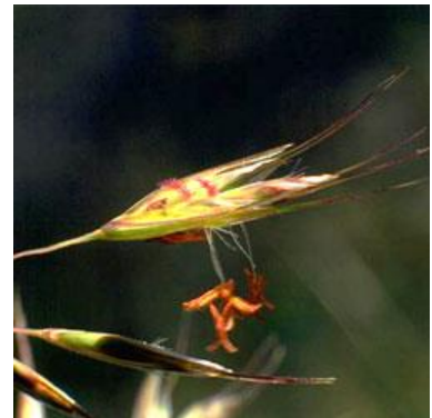
individual flower of Joycea pallida