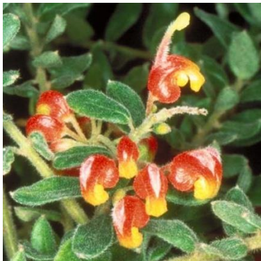
Grevillea alpina

Contact: Please provide name and phone number by email to friendsofblackmountain@gmail.com or phone Linda 02 6262 5551