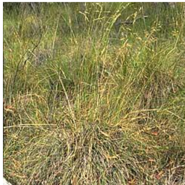
a plant of Joycea pallida in the wild