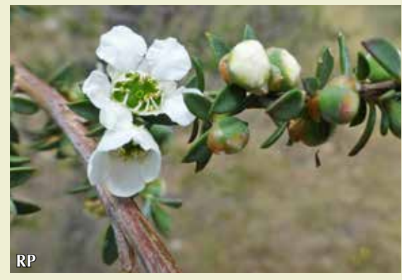
Prickly Teatree ( Leptospermum continentale ) is a shrub to 2 m tall with leaves to 10 mm long and 3 mm wide. The white flowers are scattered along the stems. Each flower has five rounded petals and many white stamens shorter than the petals. The woody fruits persist on the plant for several years. It flowers in late spring.

Ngunnawal people used the stems and leaves to make string for small baskets and fishing nets, and crushed seeds into flour for baking.