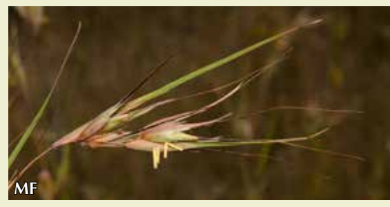
Kangaroo Grass ( Themeda triandra ) is a tufted to spreading perennial with loose clusters of flowers that appear in late spring. Each flower has a rigid black bristle up to 6 cm long.

Ngunnawal people used the stems and leaves to make string for small baskets and fishing nets, and crushed seeds into flour for baking.