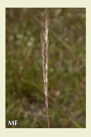
Redleg Grass ( Bothriochloa macra ) is a tufted to spreading perennial with bright green leaves in spring, and red flowering stems to 40 cm tall. The flowers occur in narrow clusters along 3-5 small stems arising roughly from the same point on the flowering stem. Each flower has a rigid greenish or reddish bristle about 2.5 cm long. It usually flowers in summer.