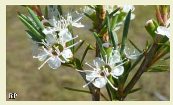
Burgan ( Kunzea ericoides ) is is a shrub to 3 m tall with leaves up to 2.5 cm long and 4 mm wide. The white flowers form dense clusters at the ends of leafy branchlets. Each flower has five rounded petals and many white stamens longer than the petals. Its fruits fall off soon after maturing. Burgan flowers profusely in late spring and summer.