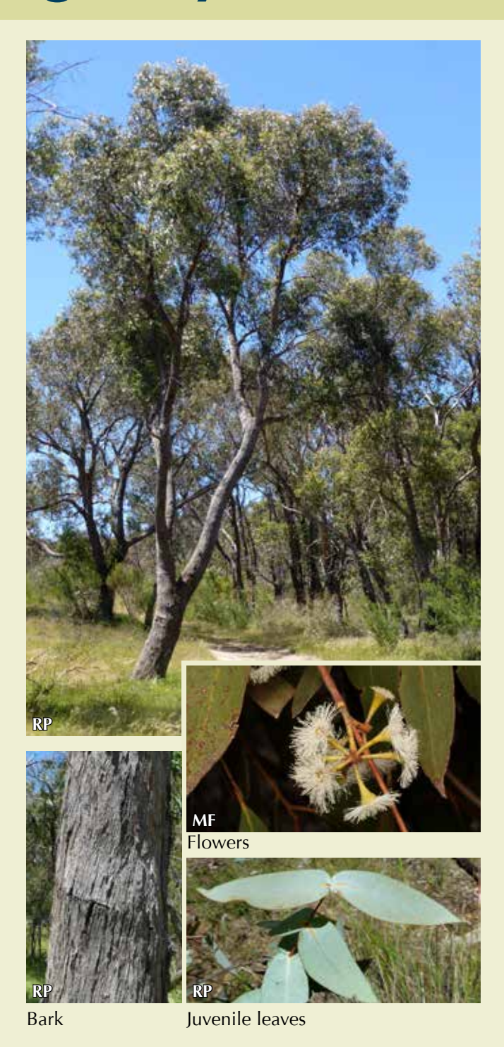
Broad-leaved Peppermint ( Eucalyptus dives ) trees have greyish, fissured bark throughout. The juvenile leaves are stalkless, broadly lance-shaped with smooth margins, and are opposite each other on the stems. The club-shaped buds are about 6 mm long and occur in clusters of 11 or more. When crushed, the juvenile and adult leaves have a strong peppermint smell.