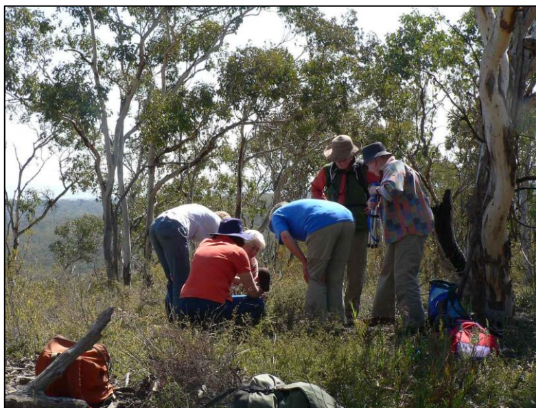
Fig. 4. Wednesday Walkers identifying a plant, September 2009.

Over the years Black Mountain has been a regular inclusion in the Wednesday Walks program, with periodic repeat visits to routes such as the Black Mountain Circuit (along the Forest Trail/Track), Black Mountain from the Botanic Gardens, and walks from entry points off Frith Road, Belconnen Way and Caswell Drive. The list of plants published on the ANPS website for each walk, and sometimes included as short articles in issues of the ANPC journal, provide a record of species in flower at various times of the year over different parts of the reserve.