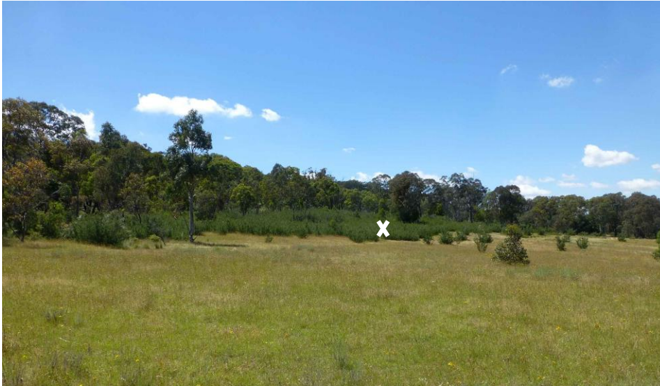
Fig. 3. Secondary grassland studied by Sarah Sharp in Smith's Paddock on the lower south-west slopes of Black Mountain. The white × shows the Burgan ( Kunzea ericoides ) shrub zone in December 2016.

In the early 1990s ecologist Sarah Sharp began researching grassland vegetation in the ACT. On Black Mountain, she studied secondary grassland sites in Smith's Paddock from 1993 to 2001 (Sharp 2018). The work involved recording the diversity and cover/abundance of plant species each year in late spring to measure changes in species composition and vegetation structure. Sharp used five transects at fixed locations selected in part to determine whether or not Burgan ( Kunzea ericoides ) was spreading into the grassland (see Fig. 3). Sharp was assisted in some years by consultant ecologists Isobel Crawford and Alison Rowell.