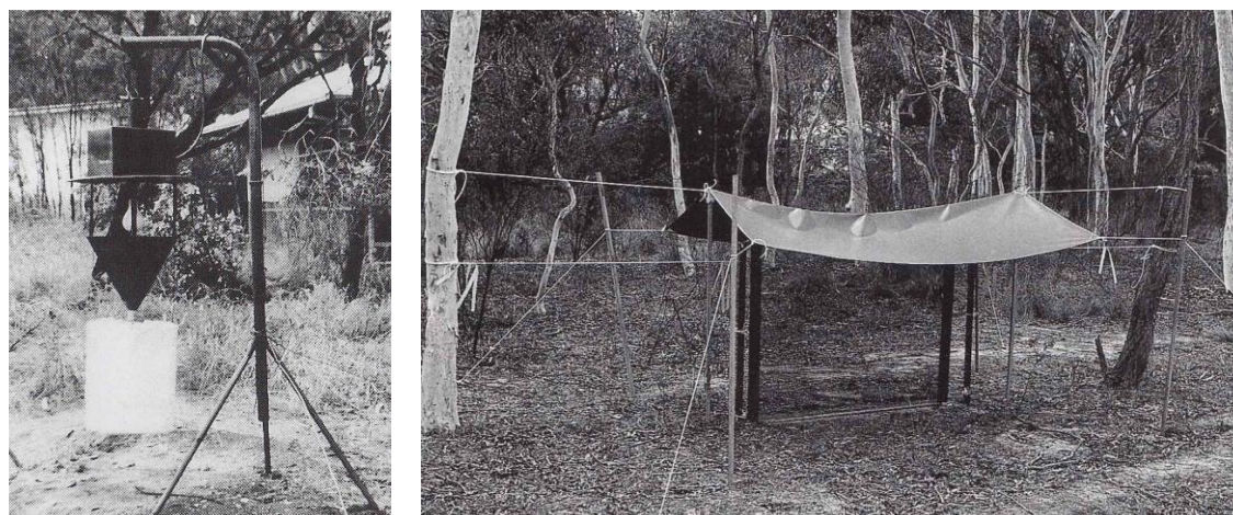
Fig. 1. CSIRO Division of Entomology insect collecting equipment on Black Mountain. a) left, Ian Common's fixed light trap, 1959. b) right, a flight intercept trap.

is now the ANBG (Upton 1997, 2018). The initial trap (Fig. 1a) was replaced around 1963 by a permanent, much larger weatherproof trap whose light was controlled automatically by a time switch (Upton 1997, 2018). The more sophisticated design of the trap (Common and Upton 1964) allowed fragile specimens, larger, heavy-bodied insects (such as beetles) and non-flying insects to be captured, including the first known specimens of a brachypterous Oecophorid moth. The trap was attended 365 days each year (Upton 1997) until the 1970s when it began to be used more intermittently (Edwards 2018). It remained in operation until at least the mid-1980s with species not previously recorded from Canberra still being captured then (Upton 1997). Flight intercept (Fig. 1b) and malaise traps (Purdie unpublished–b) were also used to capture insects from the area.