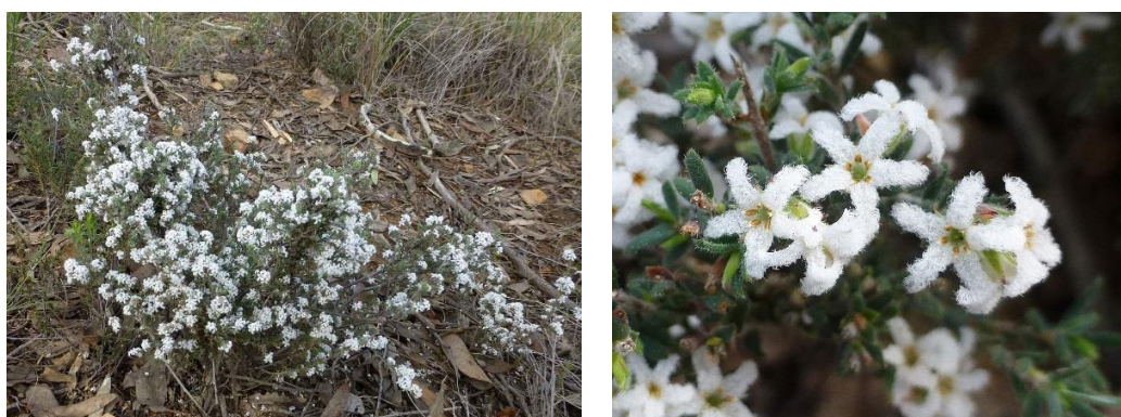
Fig. 6. Leucopogon microphyllus var. pilibundus occurs in only one localised area on Black Mountain.

From the time Canberra Nature Map went live in early October 2013 to 5 March 2018 at least 51 people had uploaded around 2360 photographic records of the flora and fauna in Black Mountain Nature Reserve and the ANBG Bushland Precinct (Purdie unpublished-c). Around 89% of the photos are of flowering and other vascular plants, at least 65% of which are orchids. While the latter largely reflects deliberate searches for orchids from spring 2015 to spring 2016 as part of a fire and orchid citizen science project (see section 5.8), opportunistic photos of orchids have been a strong feature of Canberra Nature Map records on Black Mountain from the website's start. The plant photographs include the first record on Black Mountain of the orchid Diuris pardina in 2014, and in 2016 assisted in the relocation of Leucopogon microphyllus var. pilibundus (Fig. 6), a shrub species that until then had not been recorded in the reserve since 1980. The remaining photos include invertebrates (6% of photos), non-vascular plants (fungi, lichens, liverworts and mosses; 3%), and reptiles, birds and mammals (<1% each). Individuals who have made major contributions of plant photos from Black Mountain include Ian Baird, Aaron Clausen, Peter Coyne, Jason Cummings, Matthew Mullaney, Michael Mulvaney, Mrs Ryl Parker, Ken Thomas, Jennie Widdowson and Betty and Don Wood.