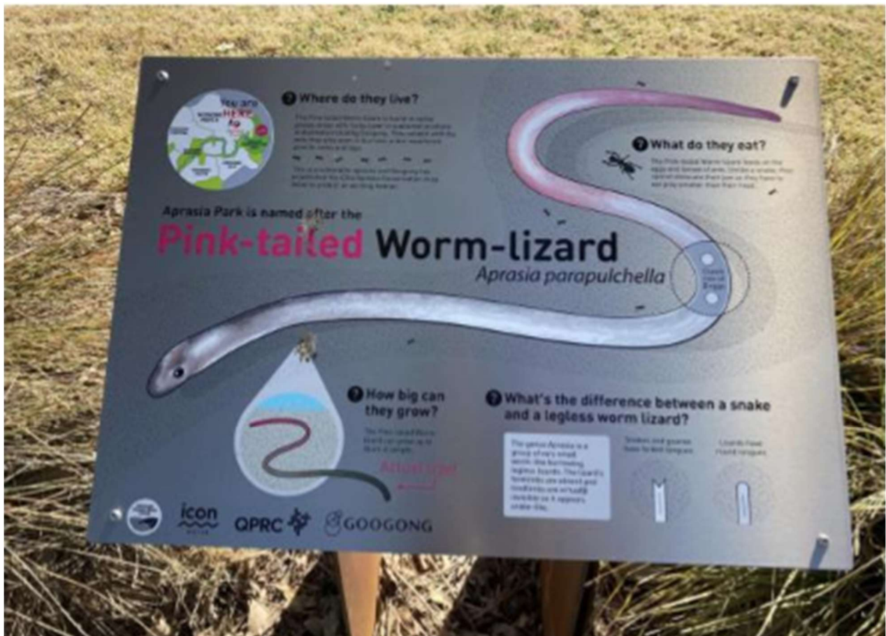
Permanent signage now displayed in Aprasia Park Googong